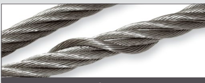
Loosening of external layer

Prior inspection of the Transport loop it must be cleaned. Within an inspection the following points have to be considered: