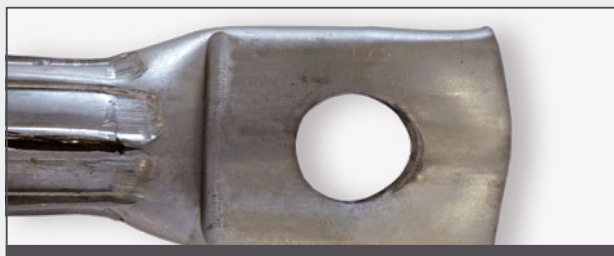
Deformation of the crimped end